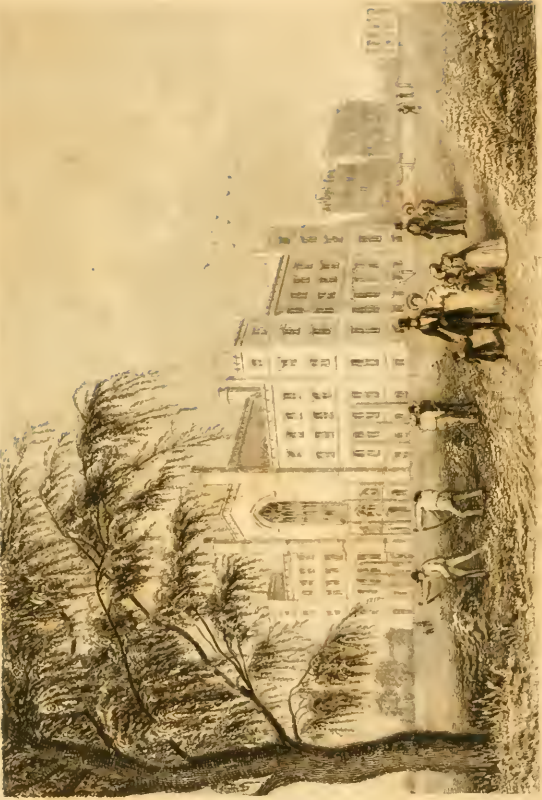
View of the City of New York from the Battery, N. Y.